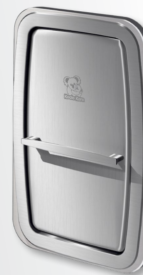
KB311-SSWM Vertical Surface-Mounted