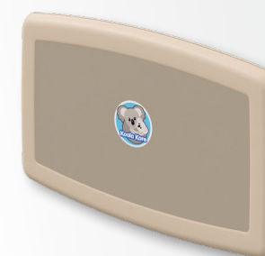
KB300-00 Horizontal — KB301-00 Vertical Surface Mounted