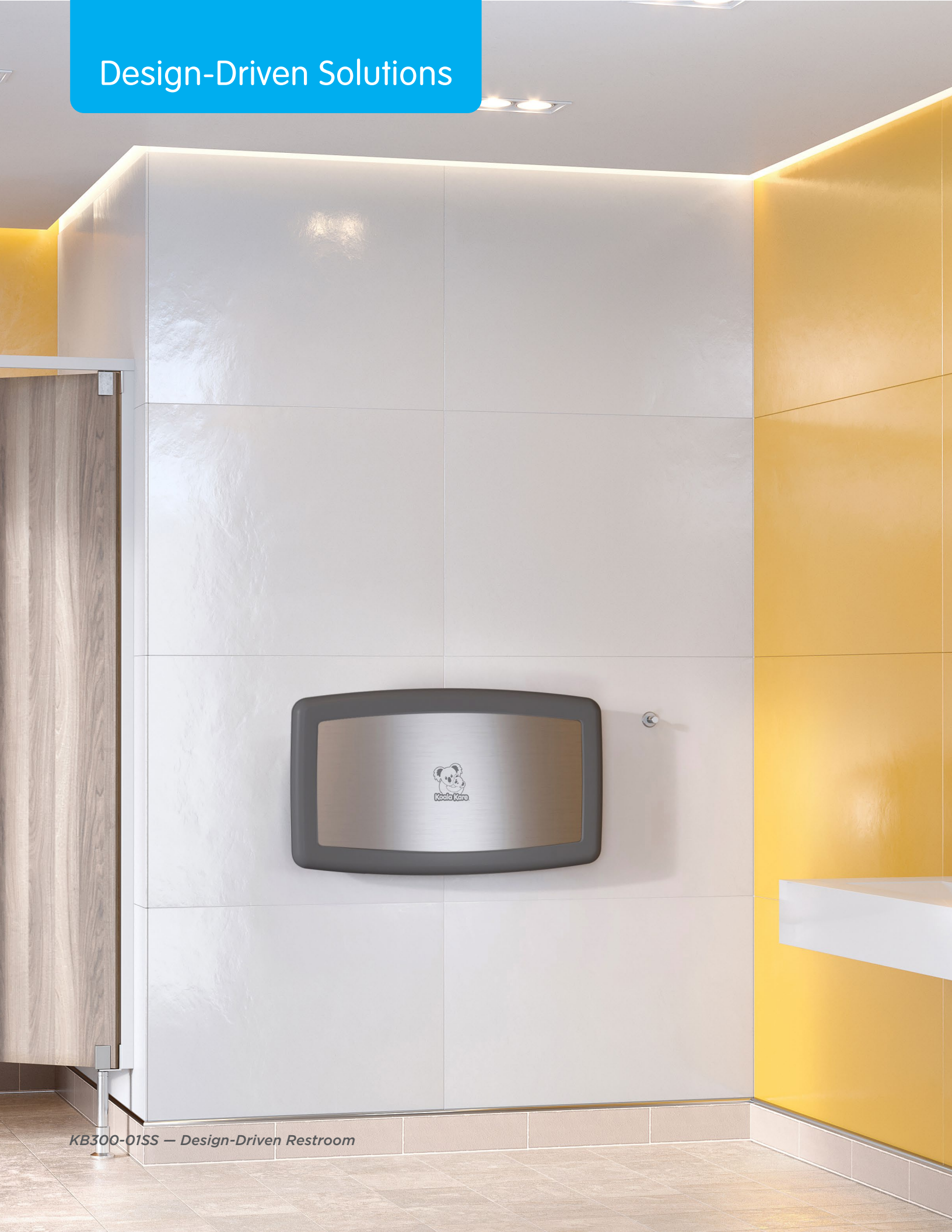
KB300-01SS — Design-Driven Restroom