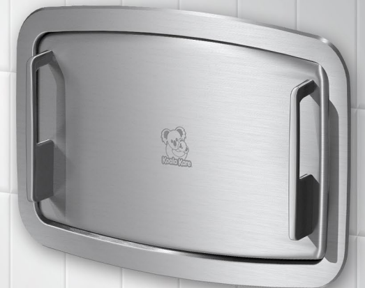
KB310-SSRE Horizontal Recessed-Mounted

Includes external stainless steel bag hook to safely stow diaper bags off the floor and in close proximity for the caregiver's use.