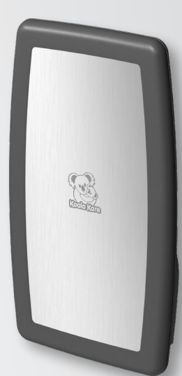
KB301-01SS Vertical Surface-Mounted