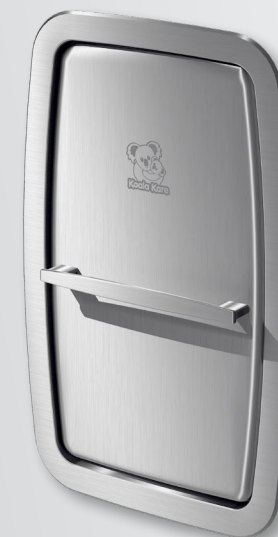
KB311-SSRE Vertical Recessed-Mounted