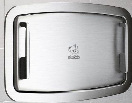
KB310-SSRE — High-Traffic Restroom