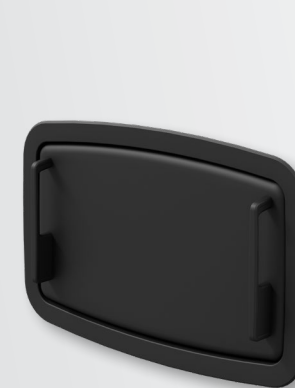
KB310-MBLK Horizontal — KB311-MBLK Vertical Recessed-Mounted