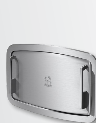
KB310-SSRE Horizontal — KB311-SSRE Vertical Recessed-Mounted