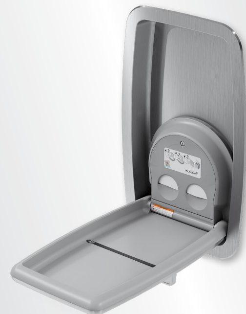
KB311-SSRE Vertical Baby Changing Station

At Koala, we understand the importance of providing safe and compliant childcare products for your patrons with children. That's why KB300 platform changing stations have been designed to meet a comprehensive range of global accessibility requirements including ASTM, EN, and ADA standards. Designing to meet these standards helps improve ease-of-use for users with disabilities and supporting the desire for safe, compliant child accommodations for your restroom.