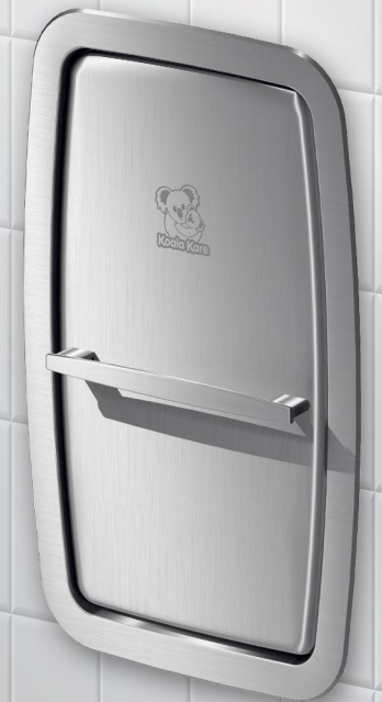
KB311-SSRE Vertical Recessed-Mounted