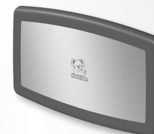
KB300-01SS Horizontal — KB301-01SS Vertical Surface-Mounted