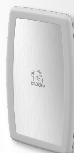
KB301-05SS Vertical Surface-Mounted