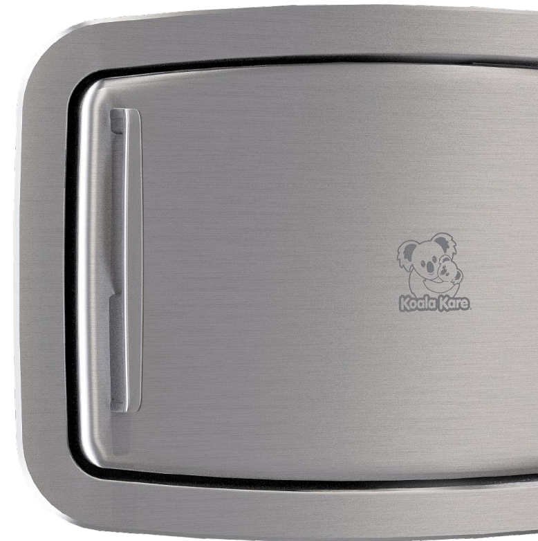
KB310-SSRE Horizontal Baby Changing Station

All KB300 platform products are designed to withstand frequent use thanks to an enhanced integral steel frame and have been tested to have minimal deflection with 200 lbs of center-loaded static weight. Koala Kare partners with Microban® to integrate powerful product protection into our baby changing stations that helps inhibit the growth of stain- and odor-causing bacteria on product surfaces. Along with amenities like an improved liner dispenser and an external stainless steel bag hook, KB300 units support an increased focus on hygiene to satisfy end-users.