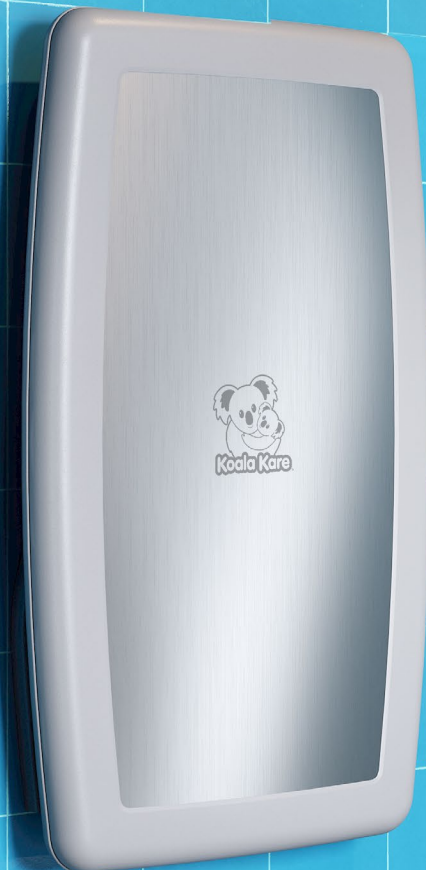
KB301-05SS — Small Space Restroom